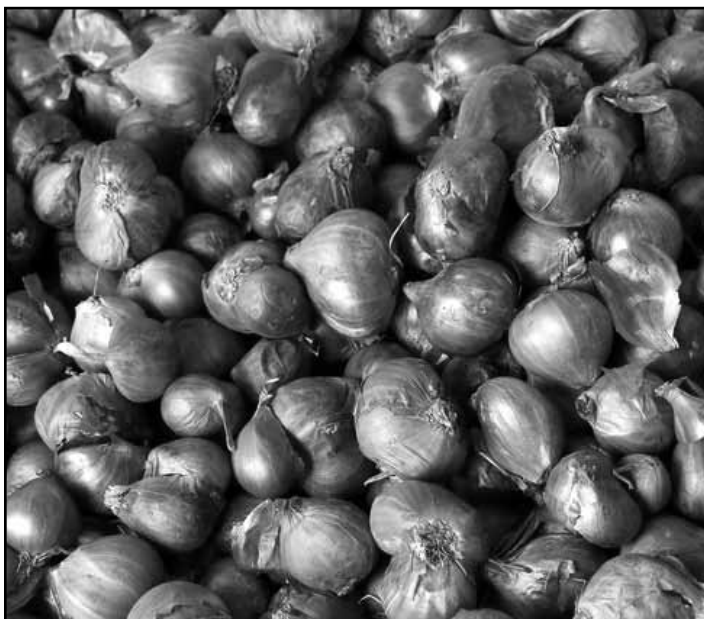
Small Red Onions