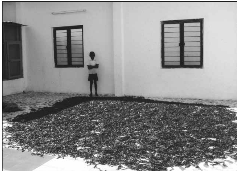
A two-month supply of chilies drying in the sun for use at our girls' home.